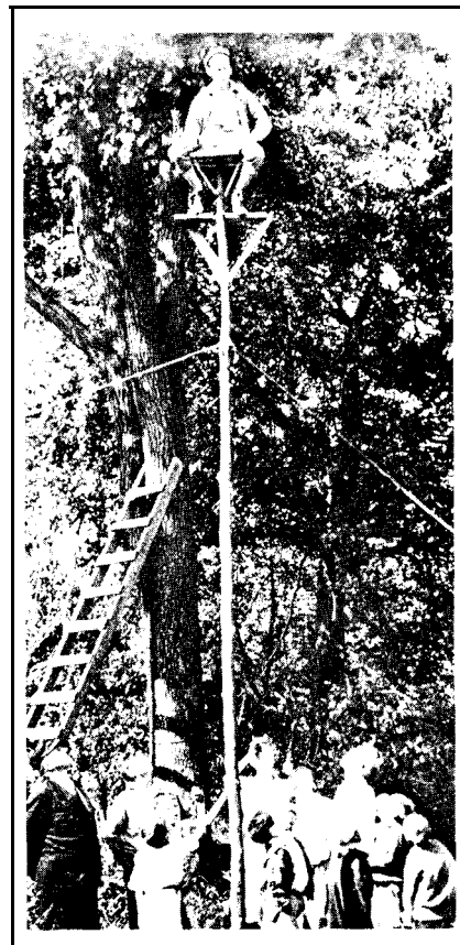
Flaggpole sitting was just one of the many fleeting crazes of the 1920s.

Another craze was started by a Frenchman, Emil Coué, after he came to this country in 1923. He