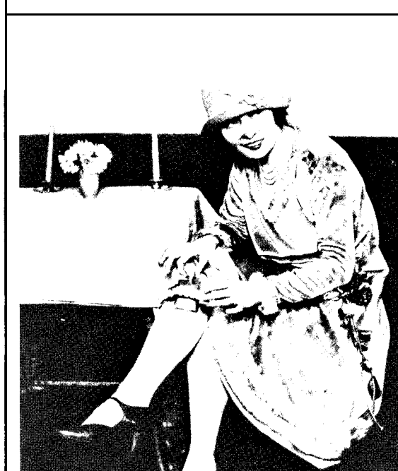
TOP: Charles Lindbergh with his "Spirit of St. Louis" after his famous solo flight across the Atlantic. ABOVE: The love affair with the automobile filled the lives of millions during the 'Roaring 20s.' LEFT: Flappers sometimes concealed flasks in their garters to evade Prohibition.