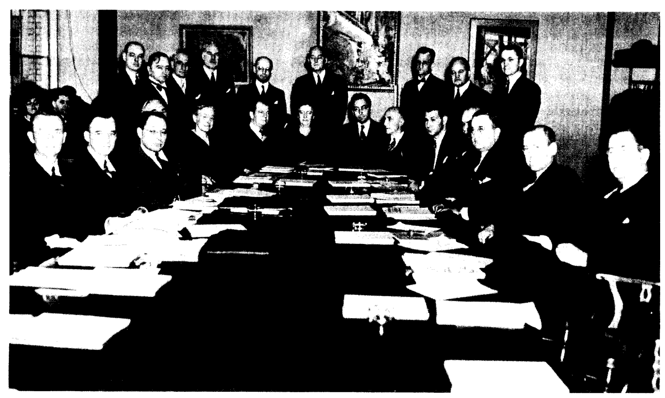
The Advisory Council on Social Security, 1937-38

for the Social Security system, the Senate Committee on Finance said in its report of the 1950 amendments: