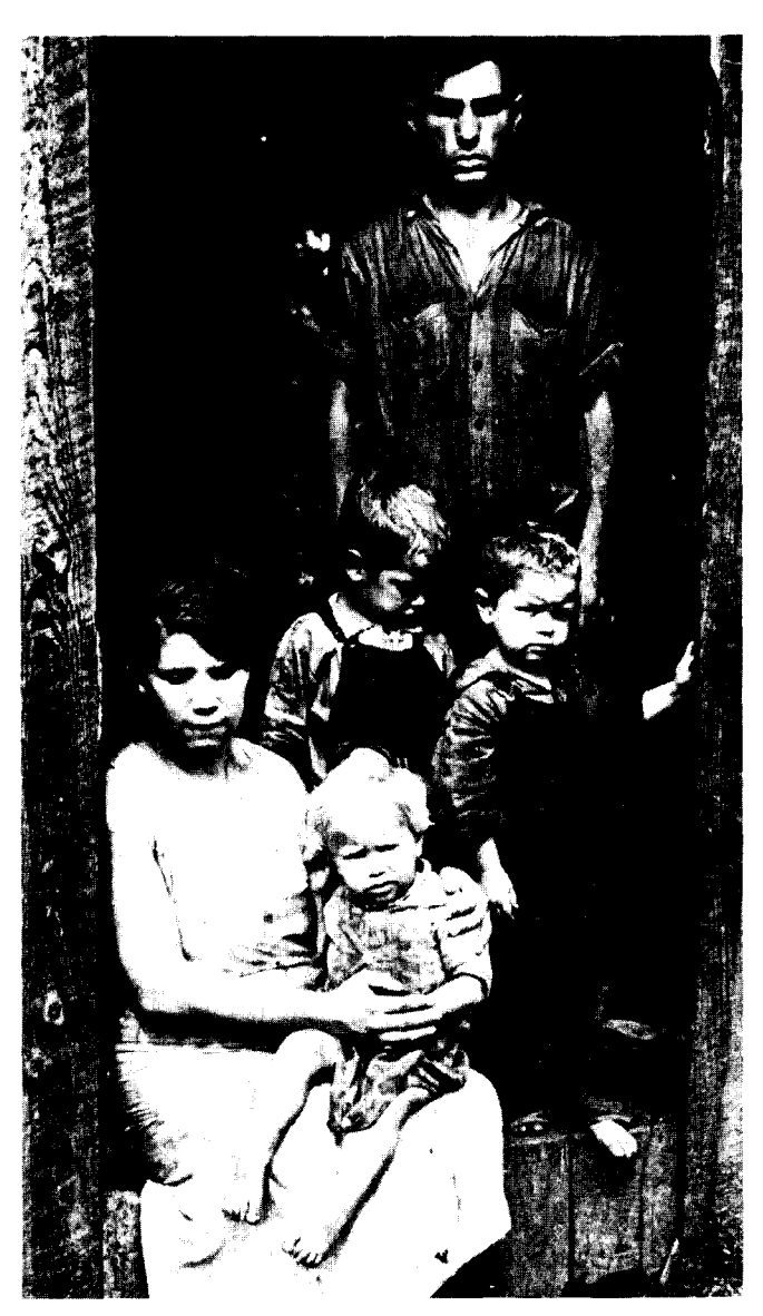
Unemployment affected many families during the Great Depression of the 1930's

Even as the Social Security legislation moved through the Congress in the late winter and spring of 1935, it was acknowledged by many supporters that the old-age program then under consideration was but a first step in providing comprehensive protection for American workers