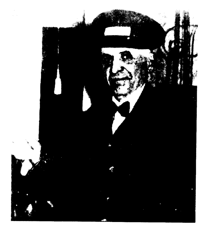
Ernest Ackerman, who received the first Social Security lump-sum payment in 1937